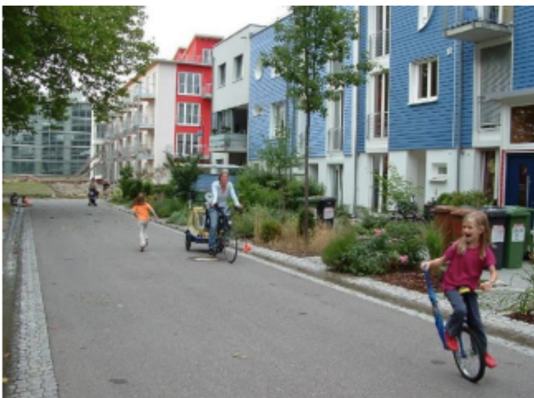
'Carfree' Residential Streets in Vauban

Germany's efforts highlight the importance of blending grassroots activism with practical solutions. Whether it's transforming cities through community-driven events or challenging industries with direct action, young people in Germany are proving that sustainability and climate justice are achievable goals for everyone.