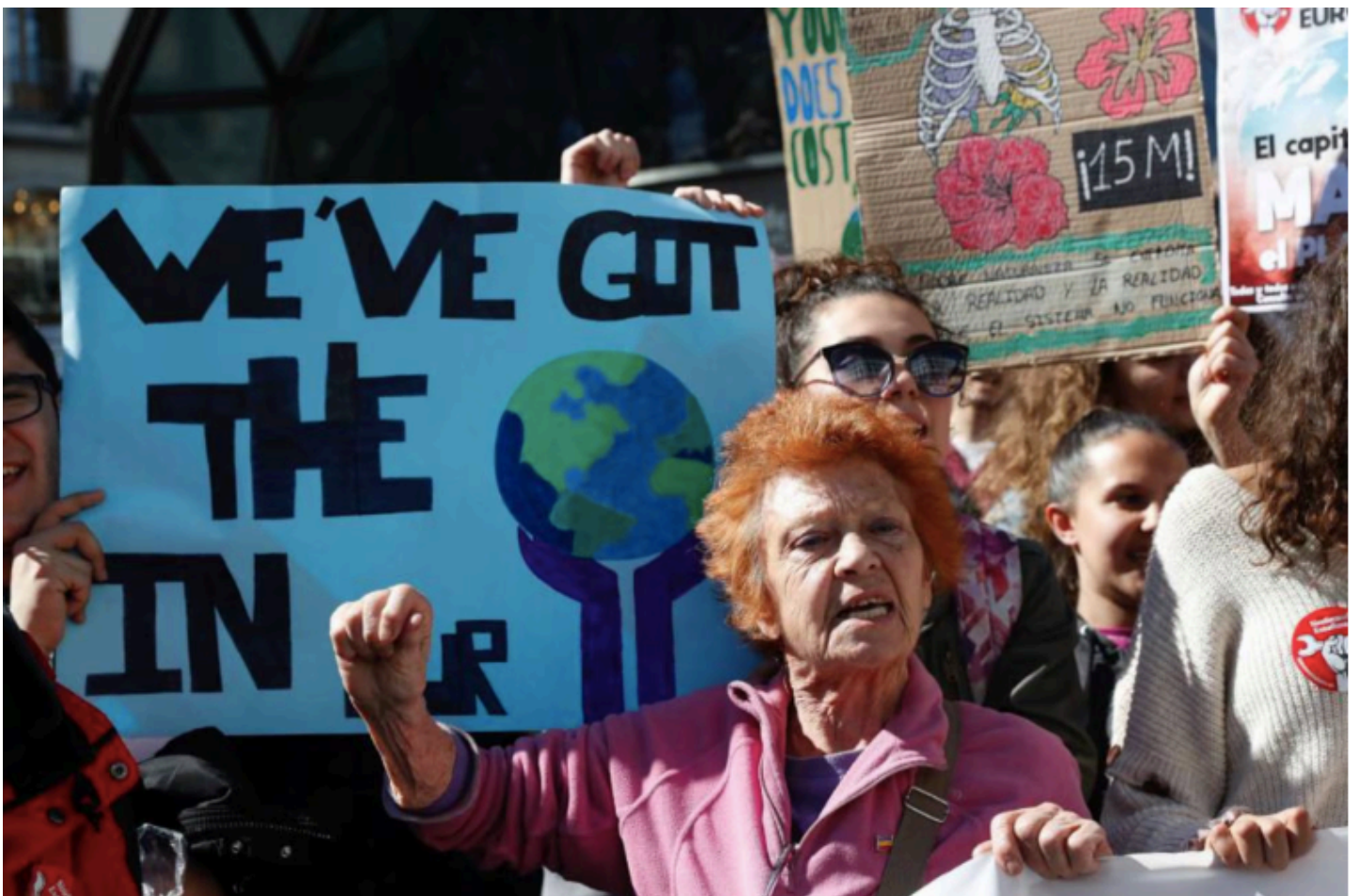
People of all ages have joined the protest in Madrid's Sol square.